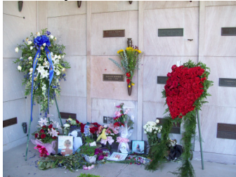
Marylin Monroe's Vault

We're on the Web! See us at: www.GhostEngineers.com