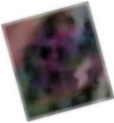
Face captured using our sonic polaroid camera at the base of the famous Suicide Bridge in Pasadena, CA. 100 people jumped to their deaths on this bridge.